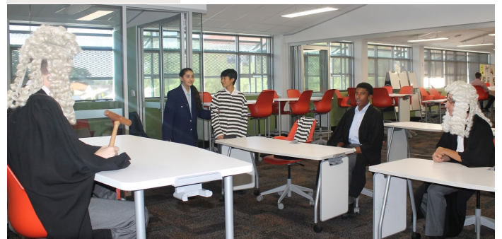
Mock Trial students using costumes at Open Day.